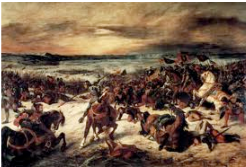
Battle of Nancy