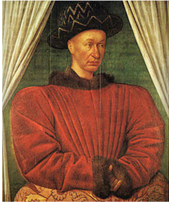
Charles VII of France