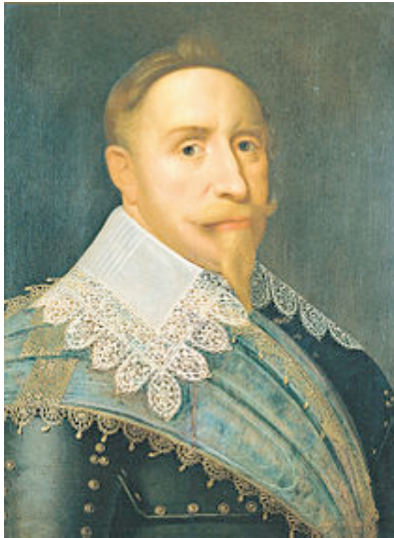
King Gustav II Adolf of Sweden