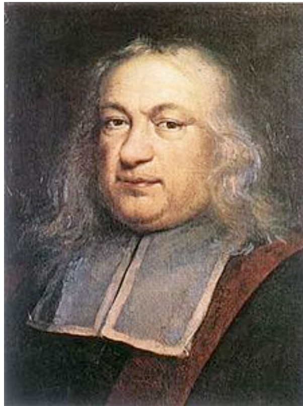
Pierre de Fermat